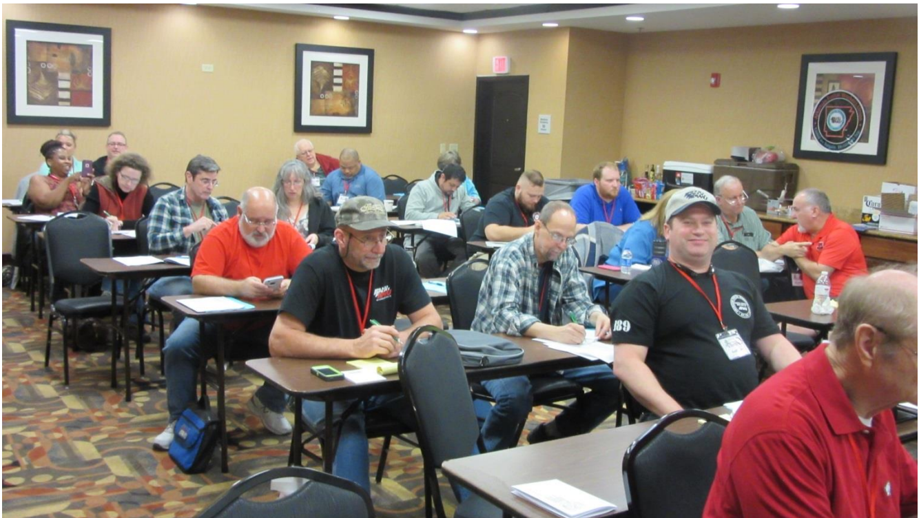
Arkansas Spring Meeting, Pine Bluff, March 16-18 (NWAAL members present)

So, the ruling is – as per the JCIM 2012 – this is an automated / telephone bidding facility. What about all the other jobs in this office that were manually bid from 2012 through present?