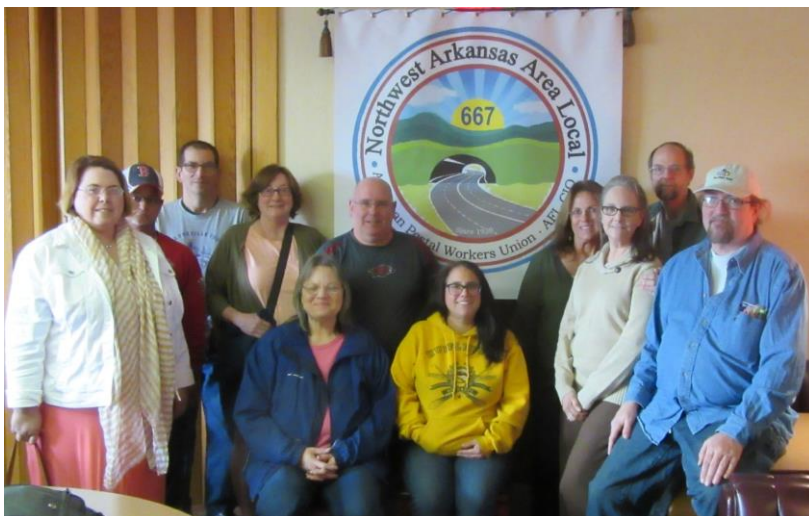
April 2016 Local Meeting